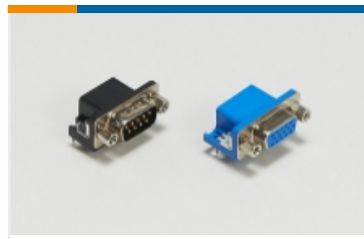
PCB D-Sub Connectors(191)